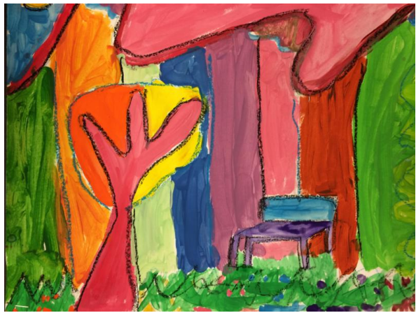
Anya Pakhladzhyan, Fourth Grade

noticed that the Fauvists used bright, non-traditional colors to create vibrant portraits and landscapes that were considered wild at the time they were painted. So wild, in fact, that the group of artists were labeled Fauvists, or "Wild Beasts". The students drew landscapes that displayed a sense of depth and used their knowledge of the color wheel to paint their pieces in the style of the Fauvist artists.