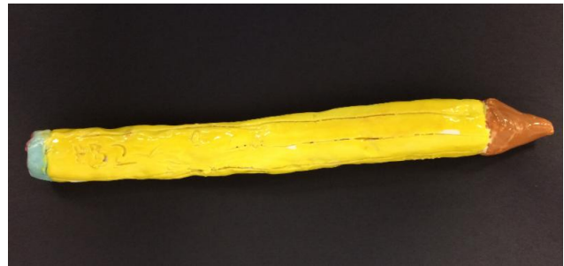
Letti Yowhannes, Sixth Grade

To continue their study of the element of art, FORM, the sixth graders examined the properties of a "successful" three-dimensional sculpture. They observed several examples of sculptures throughout art history and noticed that these sculptures could be viewed in-the-round, were very realistic, and included tactile texture indicative of the object represented through sculpture. The students created several sketches of the object of their choice and used clay tools, and building methods to create forms out of clay.