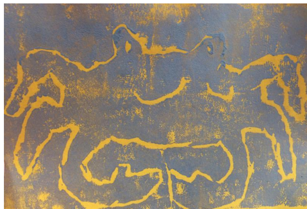
Benjamin Stangle, Kindergarten

element of art called texture (the way something feels or looks as if it might feel). They examined images of underwater animals and created detailed and textured drawings of their chosen animal. Once their drawings were complete, the students then etched their work onto printmaking foam. They then printed it on colored paper using printmaking tools and techniques.